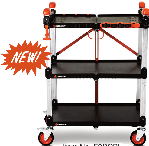
Item No. F3SCBL