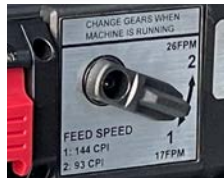
NEW two-speed gear box to maximize cut quality and provides different feed rates.