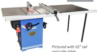
Pictured with 52" rail and side table