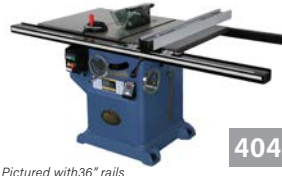
Pictured with 36" rails