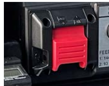
Updated heavy-duty safety switch with built-in safety lock-out.