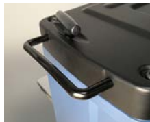
NEW steel top and heavy-duty handles for easier carrying.