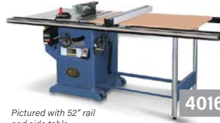
Pictured with 52" rail and side table